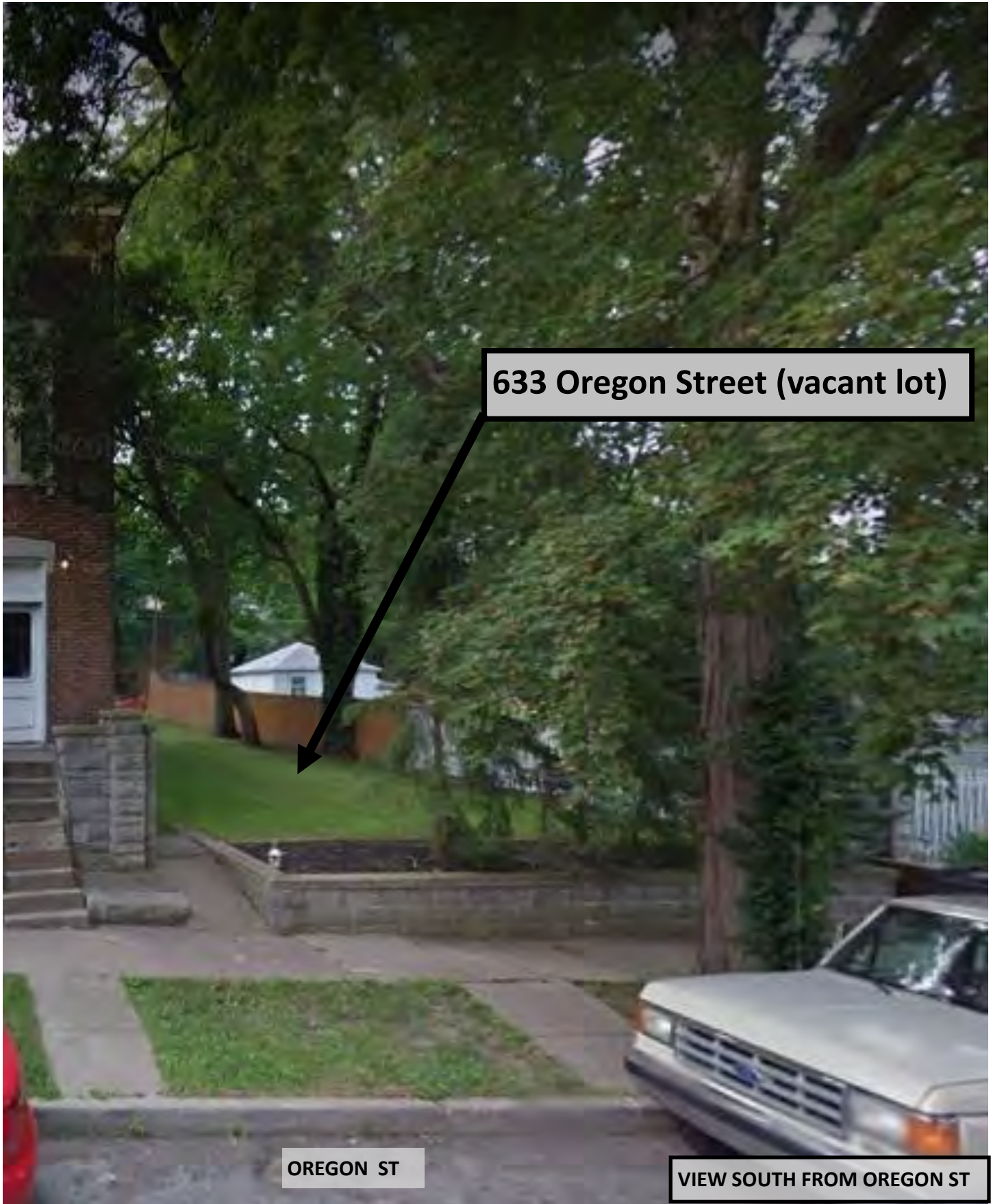
IMAGE OF LOCAL ELLSWORTH/633 OREGON STREET HISTORIC DISTRICT