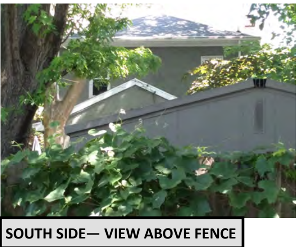
SOUTH SIDE— VIEW ABOVE FENCE