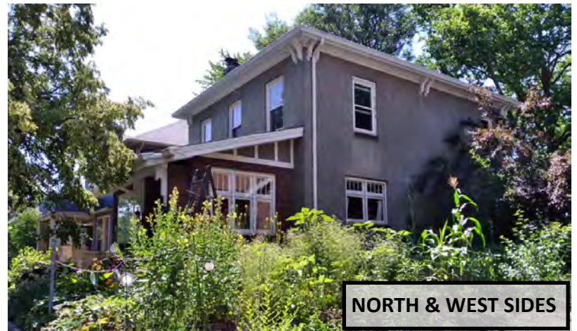
NORTH & WEST SIDES