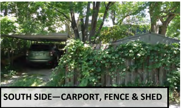
SOUTH SIDE—CARPORT, FENCE & SHED