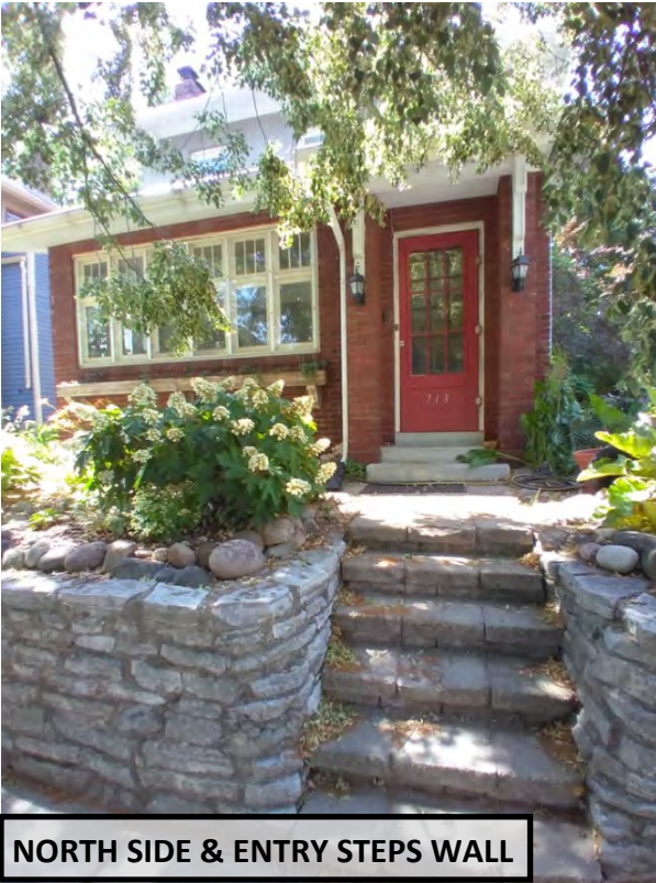
NORTH SIDE & ENTRY STEPS WALL