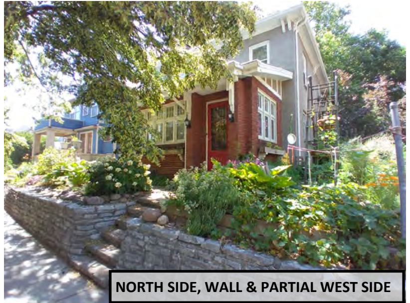
NORTH SIDE, WALL & PARTIAL WEST SIDE