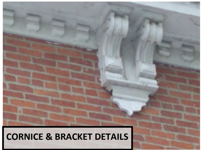
CORNICE & BRACKET DETAILS