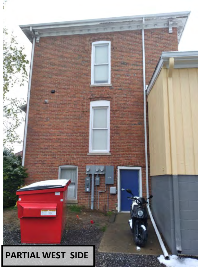
PARTIAL WEST SIDE