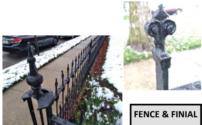
FENCE & FINIAL