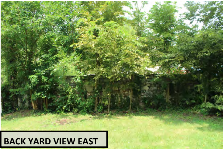
BACK YARD VIEW EAST