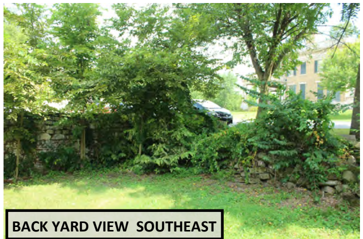
BACK YARD VIEW SOUTHEAST